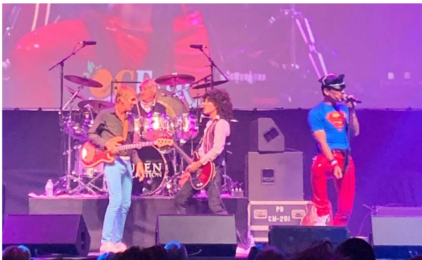
Queen Nation at the OC Fair